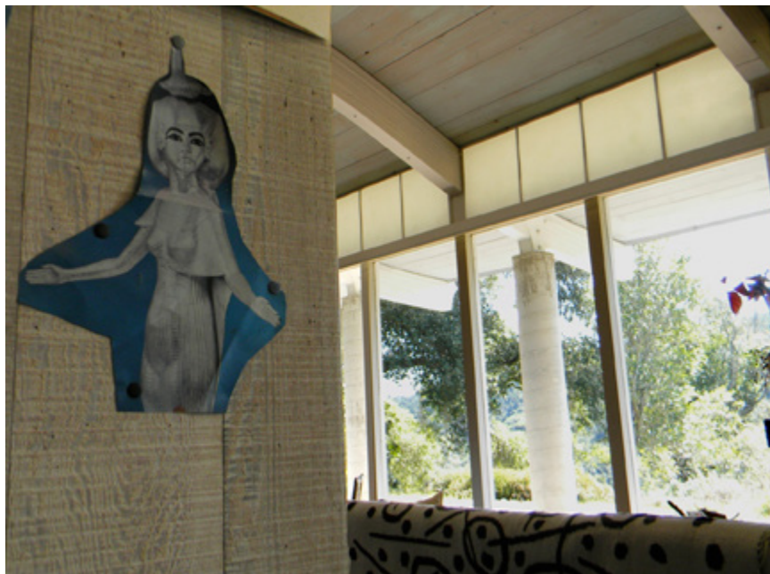
Figure 14: From Gordon Onslow Ford's home, 2012 Isis , date unknown, magazine clipping, Gordon Onslow Ford Archive, © The Lucid Art Foundation.

with Onslow Ford's cosmology is Lady of Heaven or Lady of the Sky . In one of his favorite Egyptian books on Tutankhamen, he has marked on the page with images of the Isis. "The last magical gestures by the new king Ay over the mummy permitted the Osiris, Tutankhamen, to enter the other world where he was received by the "Lady of the Sky, Nut, mistress of the gods", who offered him a libation" (Desroches-Noblecourt 246). There are many renditions of Isis, but the image Onslow Ford chose to display on the wall of his home was the one of Isis depicted on King Tutankhamun's sarcophagus.