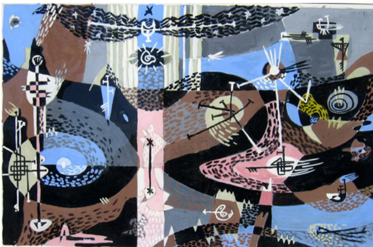
Figure 10: Gordon Onslow Ford Future of the Falcon, 1947, casein on paper, Gordon Onslow Ford Archive