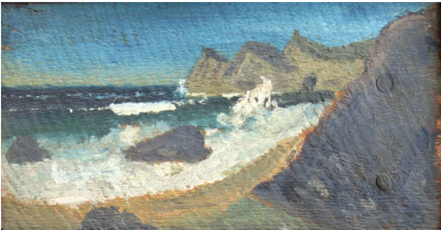
Figure 2: Gordon Onslow Ford Untitled, 1923, oil on wood, Gordon Onslow Ford Archive