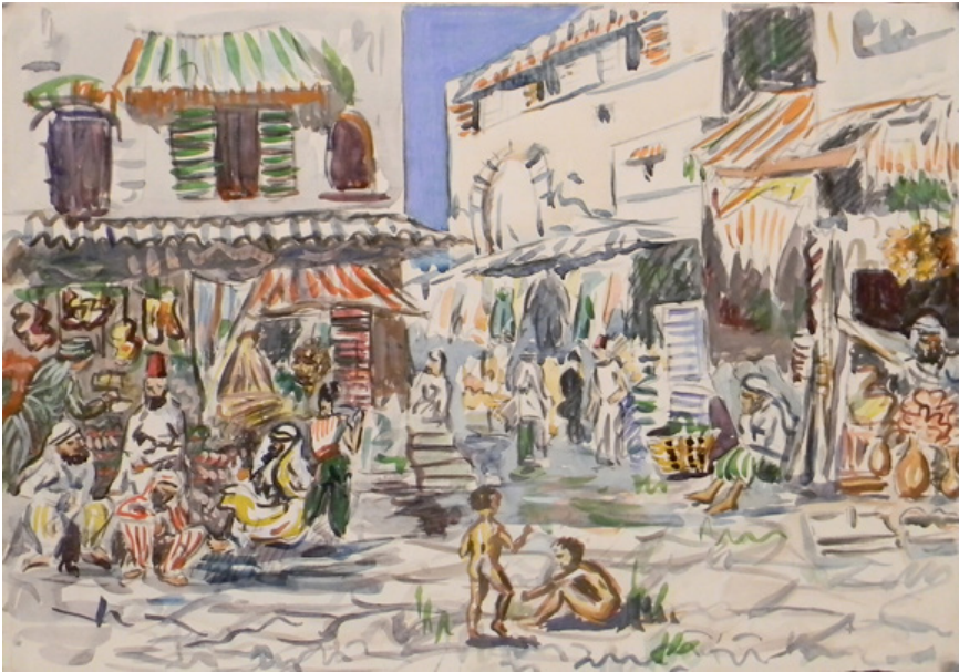
Figure 5: Gordon Onslow Ford Egypt , circa 1936, watercolor, crayon on paper, Gordon Onslow Ford Archive, © The Lucid Art Foundation.

Alexandria is huge. It takes over an hour to get into the town from the ship, but there is an opera and some good art shops. The town is new and dusty — great big blocks of cement and concrete with shuttered windows, columned awning, the canal is charming and there are some very fine gardens... There is something very exciting in the air full of the most wonderful possibilities.