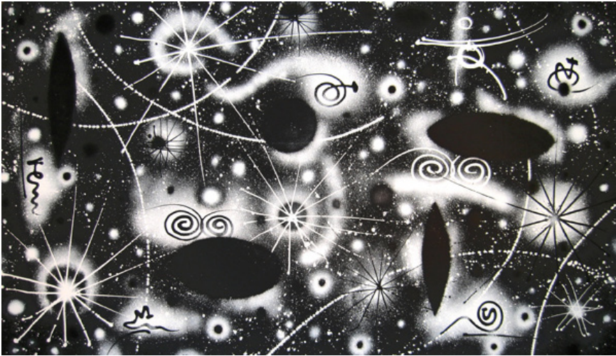
Figure 15: Gordon Onslow Ford All One's Company , 1993, acrylic on canvas, Gordon Onslow Ford Archive, © The Lucid Art Foundation.

Onslow Ford played as a child. The oval shape he created in the late 1930s continued to appear in his later paintings, but was transformed into clusters of images of a black void before his death in 2003.