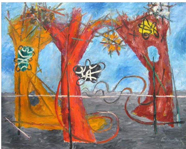
Figure 9: Gordon Onslow Ford 3 Trees Move Along, 1938, oil on canvas, Gordon Onslow Ford Archive

Tutankhamun's tomb to see beyond the horizon of his limited perception of reality? In an interview in 1999, Matta mentions, "Gordon had to give up his trees to become a surrealist."