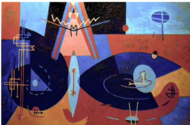
Figure 11: Gordon Onslow Ford Pyramid of the Falcon, 1949, oil on canvas