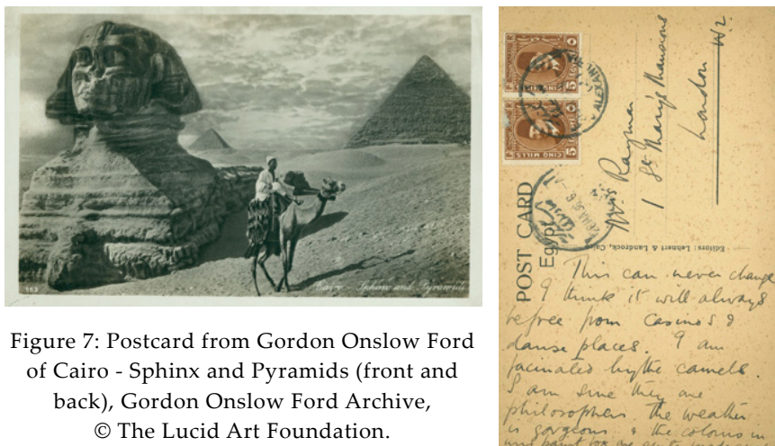
Figure 7: Postcard from Gordon Onslow Ford of Cairo - Sphinx and Pyramids (front and back), Gordon Onslow Ford Archive