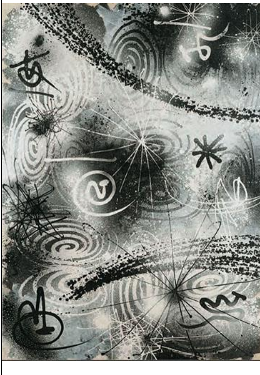
Composition, 1971, acrylic on paper on canvas, 80 x 59"

daydreaming. Almost all of Onslow-Ford's work up until 1948 explored the imaginative potential of that kind of space. It included some works that blend rigid schematic elements with more freely improvised biomorphic shapes (as seen in Time Mountain from the same year), and it is interesting to compare these early works with later abstract paintings made by the likes of Elizabeth Murray, Jay DeFeo and Frank Lobdell.