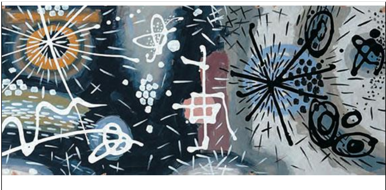
Untitled, 1980–82, acrylic on paper 17 x 76"