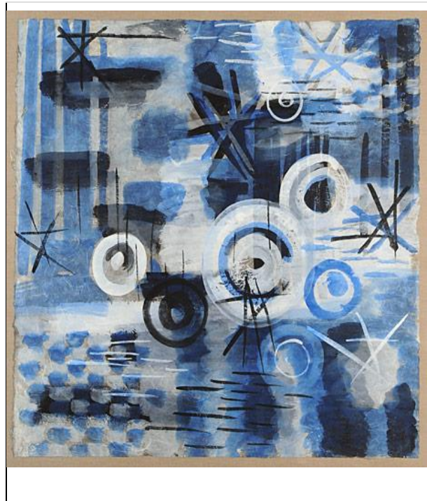
Water World, 1956, casein on mulberry paper on linen, 36 x 37"

Gordon Onslow Ford, "Centennial Celebration" @ Weinstein Gallery , through February 23, 2013.