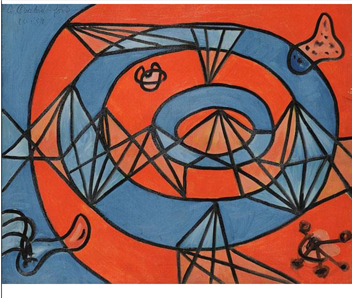
Time mountain, 1939, oil on canvas, 16 x 20"

Peggy Guggenheim was famous for many things, including mismatched earrings. Her taste for opposites also extended to her infatuations with surrealist automatism ala Joan Miró, and its more austere partner, geometric abstraction ala Mondrian. Together, they represent Ms. Guggenheim's "twin allegiances" to what she thought to be the most important movements in modern art, but also prompted the question of what a synthesis of the two might look like. Certainly, Jackson Pollock's pre-1944 work might serve as one answer to that